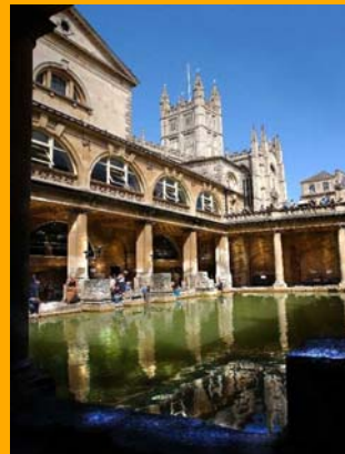
Roman Baths, Bath

Have a day in the Roman city of Bath. Visit the Roman Baths which are over 2000 years old, and experience the 21st century baths at the Thermae Bath Spa with its open air heated rooftop pool overlooking this beautiful city.