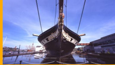
Brunel's ss Great Britain

Spend the day in Bristol visiting the many sites and soaking up the atmosphere in some of the many cafes, bars, and restaurants.