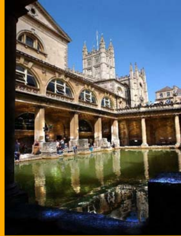
Roman Baths, Bath

Visit Longleat House one of the most beautiful stately homes in Britain en route to the cathedral city of Salisbury. From here continue to Stonehenge, one of the greatest prehistoric sites in the World