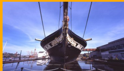
Brunel's ss Great Britain