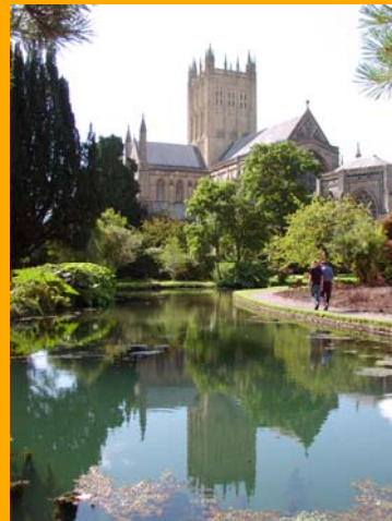
Wells Cathedral and grounds