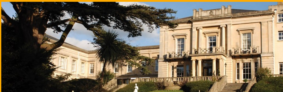
Bath Spa Hotel, Bath

Bookable through a South West England Specialist agent