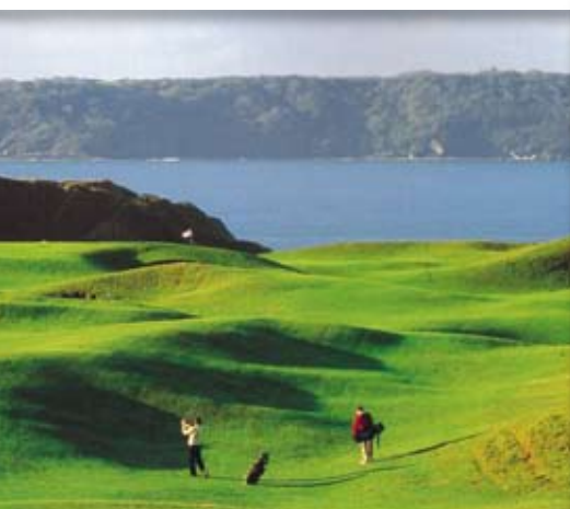
PENNARD GOLF CLUB