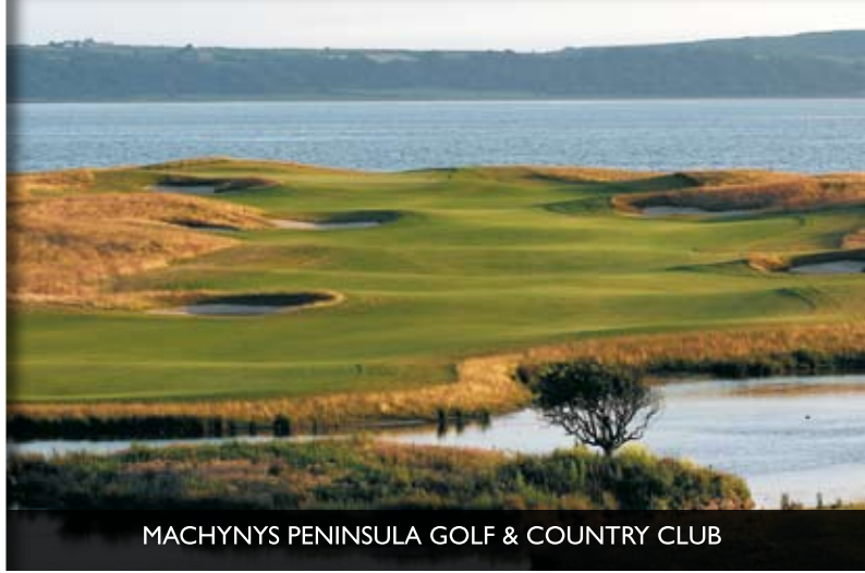
MACHYNYS PENINSULA GOLF & COUNTRY CLUB