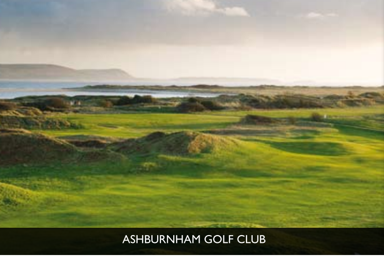
ASHBURNHAM GOLF CLUB