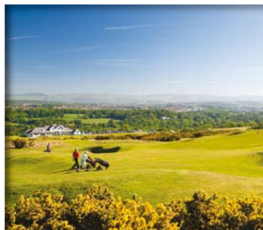
SOUTHERNDOWN GOLF CLUB