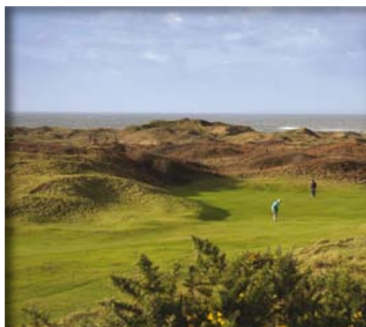
PYLE & KENFIG GOLF CLUB